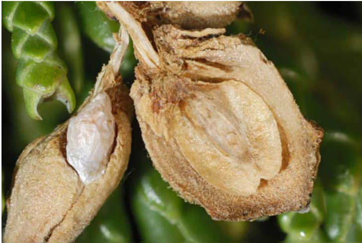
Mayetiola thujae cocoon containing developing pupa

DAMAGE: Redcedar cone midge larvae feed on scales and seeds throughout individual cones. Each larva is capable of destroying more than one seed.