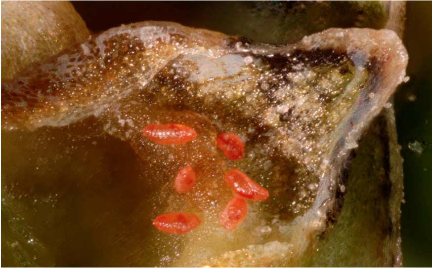
Mayetiola thujae larvae on exposed redcedar cone scale (D. Manastyrski)

LARVA: Eggs hatch in April and developing larvae feed inside cones, each destroying more than one seed. Larvae are shiny orange, segmented maggots, about 3-4 mm long when fully grown. Larvae may be found anywhere within the cone tissue.