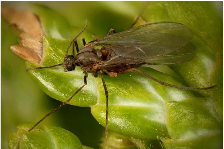
Mayetiola thujae adult on redcedar foliage