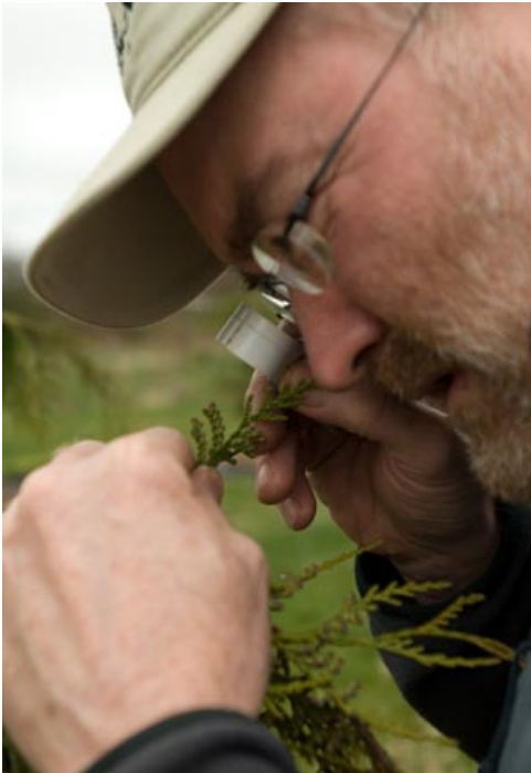
Searching for freshly laid Mayetiola thujae eggs on western redcedar cone scales. (D. Manastyrski)

Redcedar cone midge populations should be monitored on an annual basis in seed orchards and controlled when necessary. Redcedar conelet surveys should be performed on a weekly basis from immediately after redcedar pollination is finished (March) until midge egg-laying is completed (late March to early April).