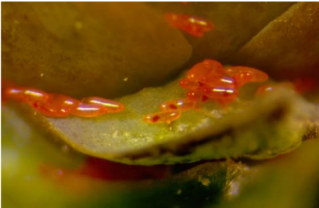
Mayetiola thujae eggs on redcedar cone scale (D. Manastyrski)

EGG: Orange-red (vermilion) and cylindrical, about 0.8 mm long by 0.2 mm wide. Contrast with green colour of cones makes redcedar cone midge eggs relatively visible without magnification. Eggs are found on or between cone scales either singly or in groups numbering up to 45.