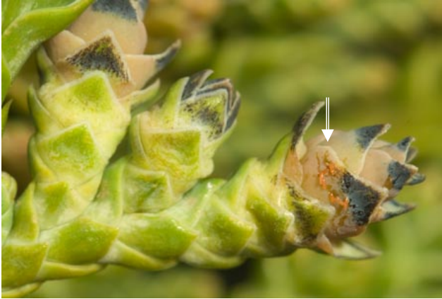
Mayetiola thujae eggs on a redcedar conelet (D. Manastyrski)

EGG: Orange-red (vermilion) and cylindrical, about 0.8 mm long by 0.2 mm wide. Contrast with green colour of cones makes redcedar cone midge eggs relatively visible without magnification. Eggs are found on or between cone scales either singly or in groups numbering up to 45.