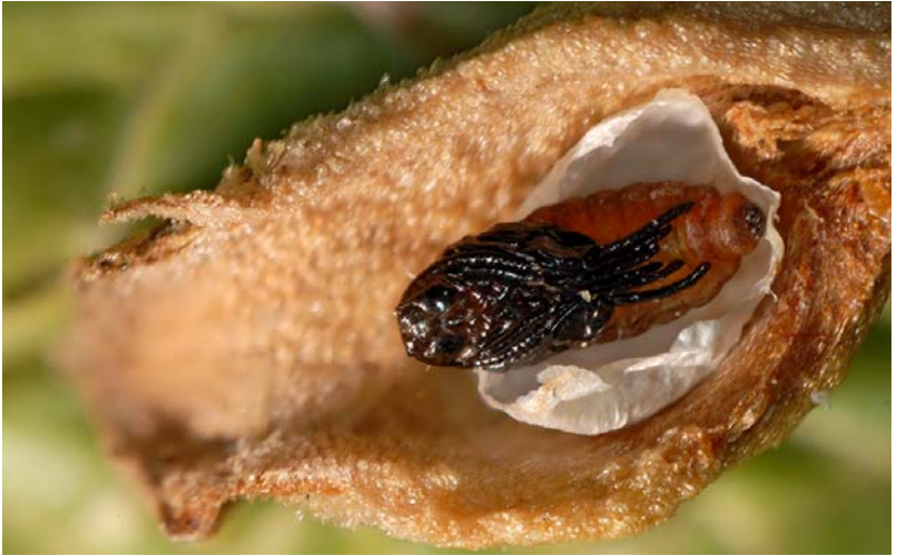
Mature Mayetiola thujae pupa extracted from cocoon. Legs and other features of the adult midge are visible.

ADULT: Adults emerge from old cones in early spring (March) during redcedar pollination period. After mating, female midges lay eggs on pollen-receptive seed cones. Mosquito-like adults are about 3 mm long, dark grey, and have clear wings with a small number of distinct veins. Many midge species look like this and field identification of redcedar cone midges is difficult unless the adults are reared from redcedar seed cones, captured in traps baited with cone midge sex pheromone, or observed laying eggs on cone scales.