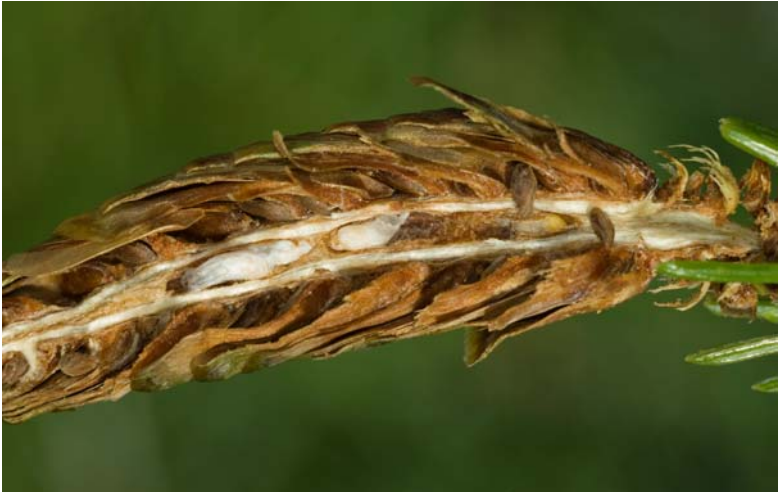
Kaltenbachiola rachiphaga larvae in a spruce cone axis. (D. Manastyrski)