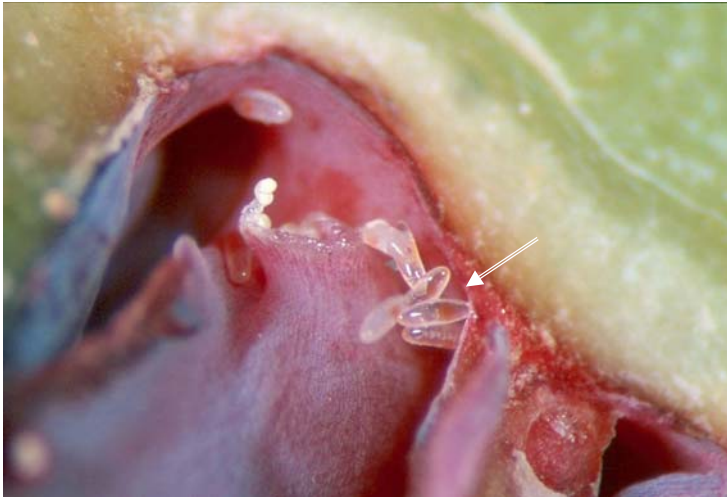
Kaltenbachiola rachiphaga eggs on spruce conelet (W. Strong)

EGG: Whitish, oblong, 0.3 x 0.1 mm, laid at base of conelet scales at pollination time. Eggs are difficult to see without a microscope.