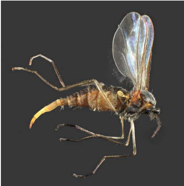
Preserved Kaltenbachiola rachiphaga adult female (W. Strong)