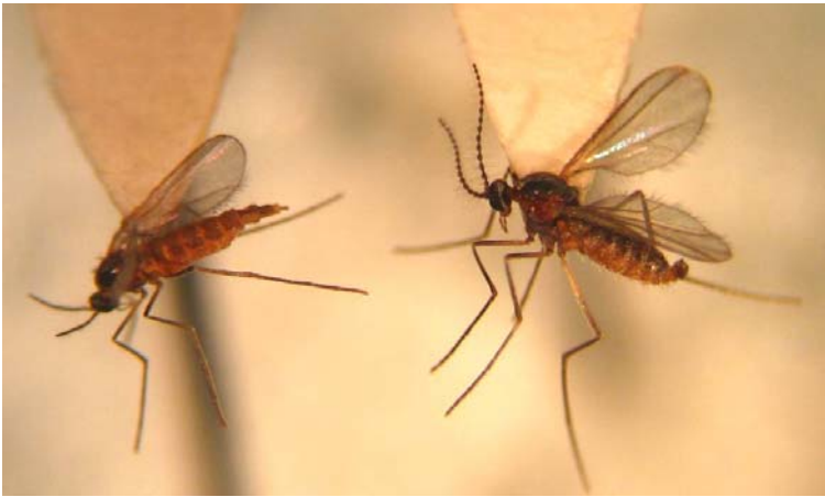
Preserved adult Kaltenbachiola rachiphaga (female left, male right) (J. Corrigan)

Adults emerge from pupal cocoons in old, overwintered spruce cones during the host pollination period in late spring, usually around May or June.