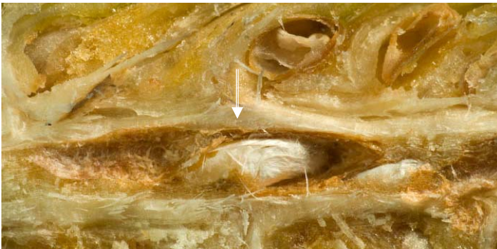
Kaltenbachiola rachiphaga overwintering larva in papery cocoon in spruce cone axis. (D. Manastyrski)

PUPA: Larvae pupate in mid-spring in their paper cocoons in cone axes; adults emerge about ten days later. Young pupae are whitish, darkening as they mature. Pupae are about 2.5 mm long.