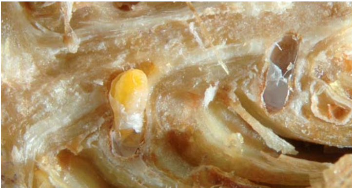
Mature Kaltenbachiola rachiphaga larva at the base of a cone scale (W. Strong)

Young larvae enter scale tissue near an ovule, mine through the tissue, and enter the cone axis by mid-summer. Feeding ends in mid-summer and larvae spin white, papery cocoons in axis cavities where they overwinter. They are capable of extended diapause. Mature spruce cone axis midge larvae in cone axes may be misidentified as spruce seedworm caterpillars, Cydia strobilella . Seedworm caterpillars are also found in cone axes, but are pale yellow, up to 10 mm in length, and do not spin cocoons.